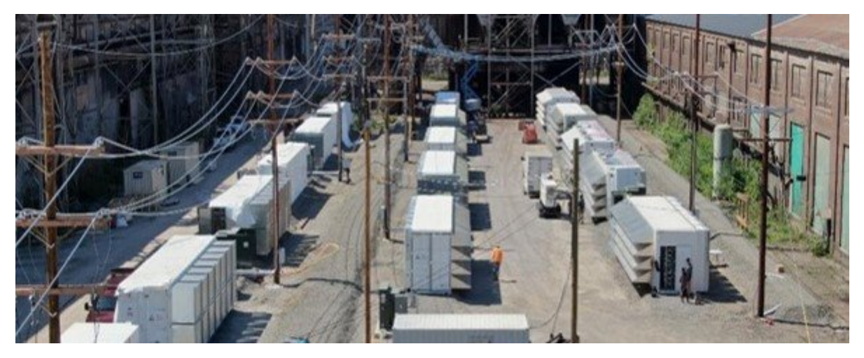
Aerial view of Midland, Pennsylvania facility expansion

8. Continue to explore further asset or development site sales to free up capital for deployment at our preferred sites / those sites which best meet Mawson's investment criteria.