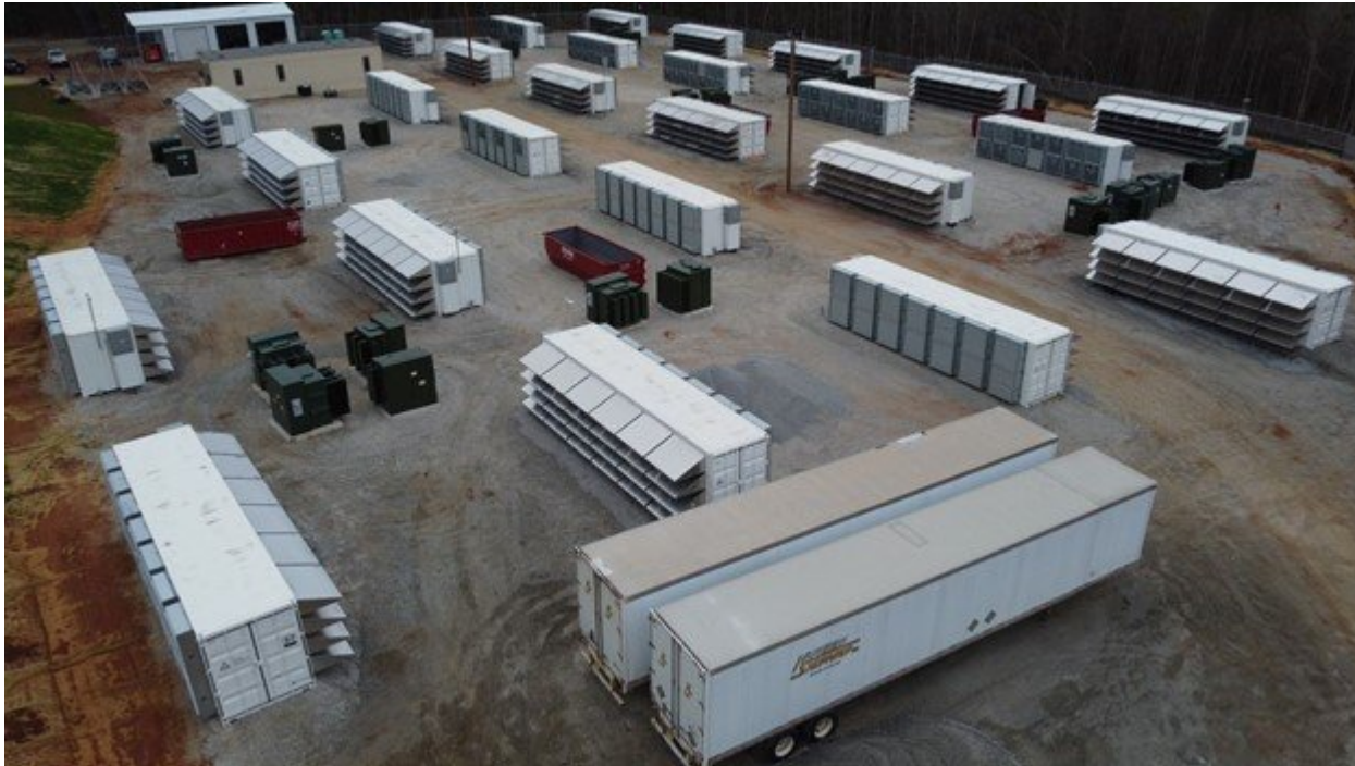
Aerial views of Sandersville, Georgia facility expansion