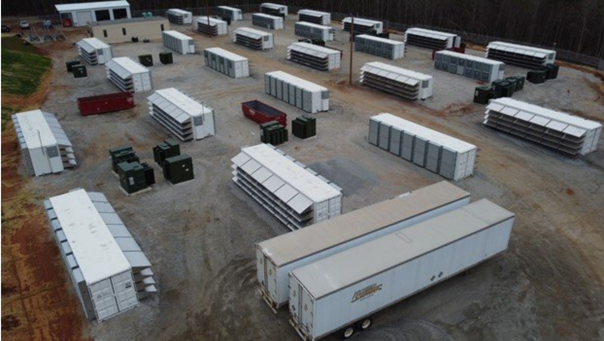
Aerial views of Sandersville, Georgia facility expansion