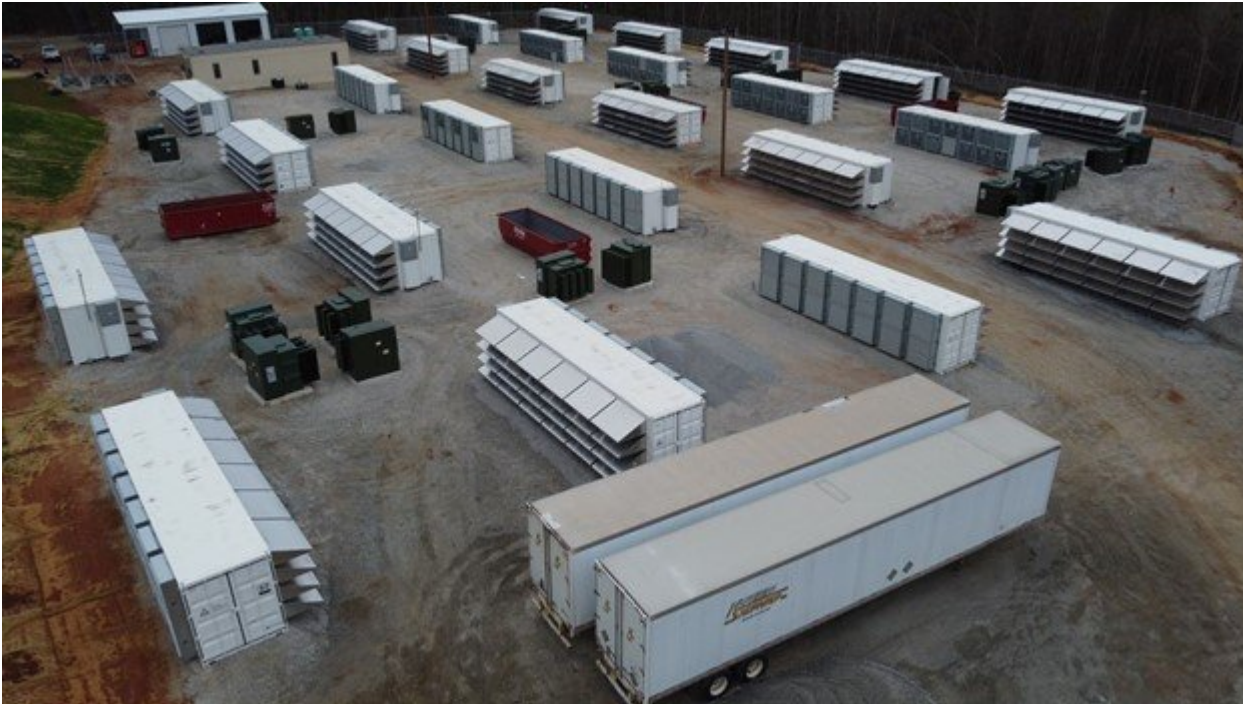
Aerial views of Sandersville, Georgia facility expansion